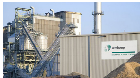
Wilton Location: Middlesbrough, England Customer: SembCorp Utilities (UK) Limited Start-Up Year: 2007 Capacity: 31 MWe Fuel: Short Rotation Coppice (SRC)