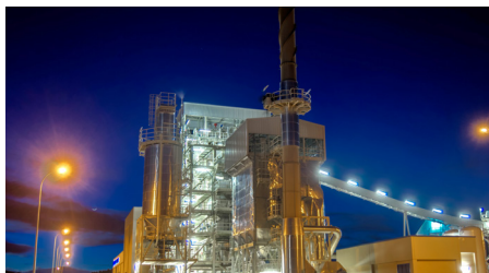
Biomass de cantabria at Reocin Location: Reocin, Torrelavega, Spain Customer: Ingeteam Power Plants, S.A. Start-Up Year: 2012 Capacity: 10 MWe Fuel: Biomass