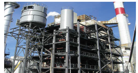
Portucel Viana Location: Viana do Castelo, Portugal Customer: Stora Enso Hytyle AB Start-Up Year: 2006 Capacity: 11 MWe Fuel: Biomass